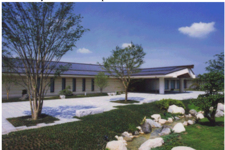
Nara Prefecture Complex of Man’yo Culture

The Complex of Man’yo Culture hopes to continue this dissemination of information about the Man’yo-shu and its culture both within and outside of Japan.